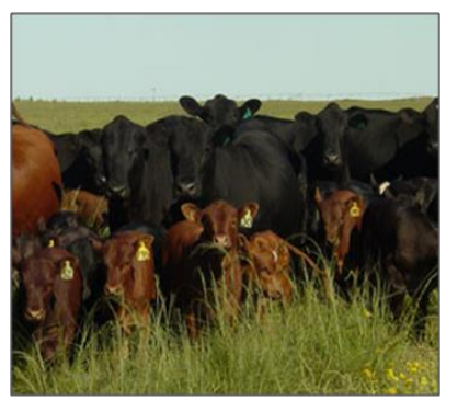
Mashona Cattle Breed