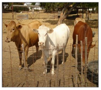
Tuli Cattle Breed