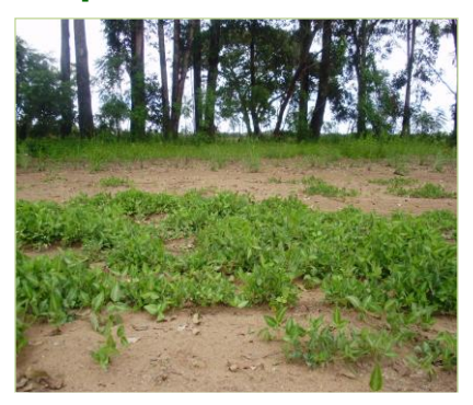
Sunnhemp (Crotalaria juncea)