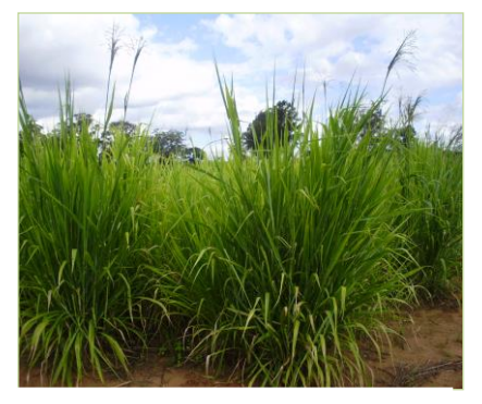
Brachiaria Grass spp.