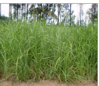
Katambora Rhodes Grass