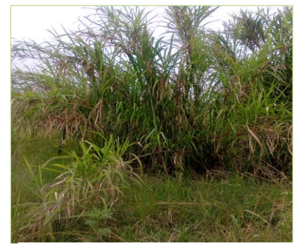
Bana Grass Seed Stock